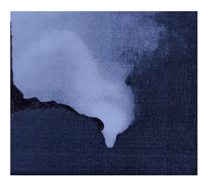
Fig. 2. Electron diffraction pattern from the surface of the contact layer, P = 5.0 MPa (EM-4, shooting for reflection, U = 35 kV)

The contact zone, which adjoins the friction surface and separates the coating material from the antifriction film (polydisperse particles of graphite), represents the thinnest plastic deformable layer. This layer, according to the micro X –ray spectral analysis (MAR-3, probe diameter 1 \mu m), is a conglomerate of dispersed phases, mainly silicides, borides and solid solutions, which are very difficult to determine exactly.